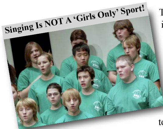
Singing Is NOT A 'Girls Only' Sport!

The Frederick Children's Chorus is an independent, non-profit organization, and is not affiliated with any other organization, church, or school system. Children who enroll in the Chorus should be responsible and willing to make a commitment to the organization. The biggest commitment is time. Children attend one rehearsal each week but home practice is also required. The annual cost of participation $350.00 (about $10/week), is minimal compared to other activities and other children's choruses in the region.