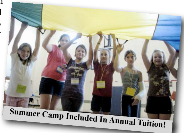
Summer Camp Included In Annual Tuition!

New members will receive a complete rehearsal schedule in August. Most rehearsals are held on Tuesday evenings, with occasional rehearsals on other week nights and